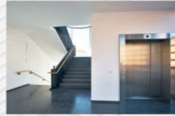
LIFT LOBBY AND STAIR