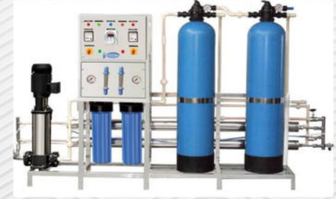
Water Treatment Plant