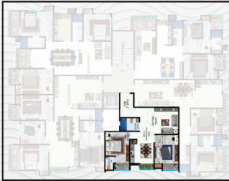
Flat - C Key Plan