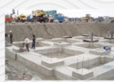
FOUNDATION AND STRUCTURE

Floor: Anti skid ceramic tiles Wall: Ceramic tiles upto 7 feet height Water proofing on wall & floor Ceiling: Putty Geyser: Geyser point in all toilets Sanitary Ware : Good quality make CP Fitting : Good quality make