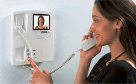
Video Door Phone