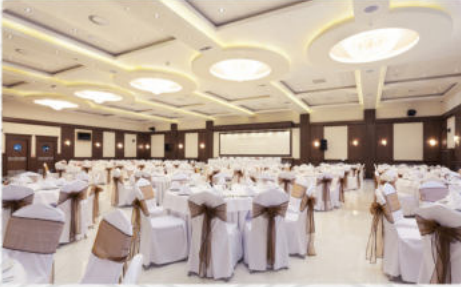
AC Community Hall