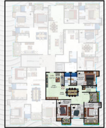
Flat - B Key Plan