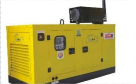
24 Hrs Power Supply