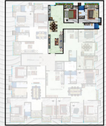
Flat - D Key Plan