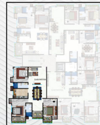
Flat - A Key Plan